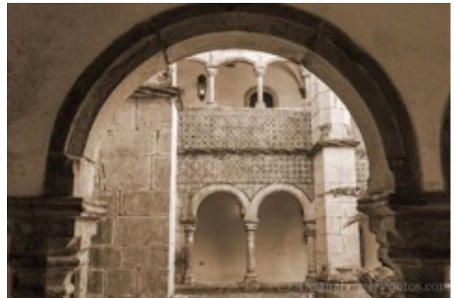
"Arches, Pena Castle, Portugal"

Some of her photos are in the UNIVEST Bank in Logan Sq., Rt. 202, New Hope with a group of NHAL members until May 31. Planning ahead, she has a photo in the Phillips Mill Photographic Exhibition June 4-25.