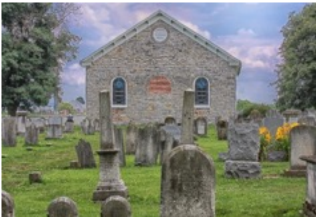
"Before the Rain, Old Leacock Presbyterian Cemetery" 13"x9" photo by Cheryl Bomba

http://artistsofyardley.org/JuriedShowPage.html#gallery