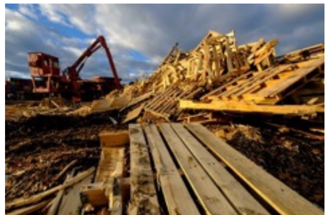
"Palette Grinder & Palettes, Perth Amboy, NJ"