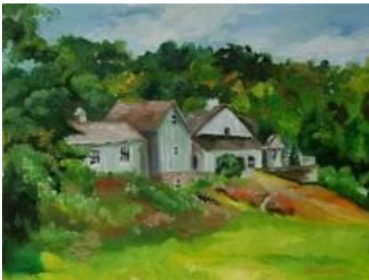
"Holecolm-Jaminson Farmstead" Oil on Panel by Christina Poruczynski

Also, a plein air painting will be on display in the juried "Gallery U Boutique Gallery Show", Westfield, NJ, from Feb 6 - 29, 2016.