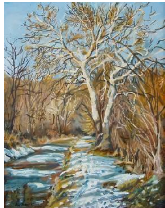
Joe Danciger's "Sycamore on the Towpath"

http://percontra.net/issue/winter-2015/nonfiction/beginning-nature-again-joe-dancigers-landscape-paintings/