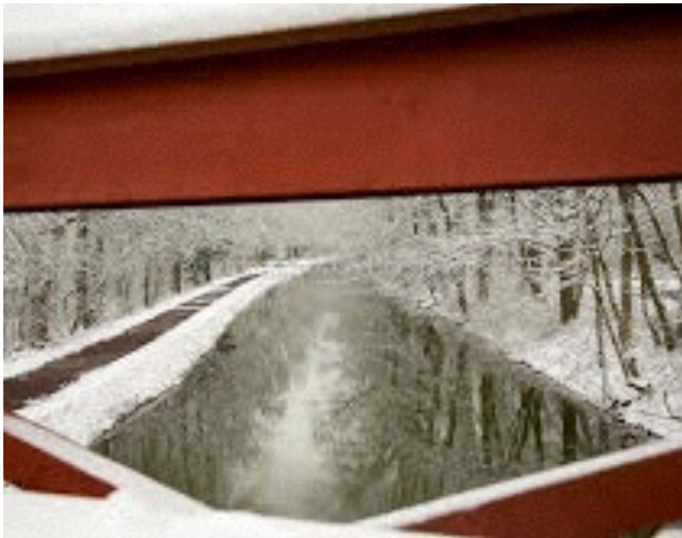
"Canal Through Red Bridge" , archival digital photo by Donna Lovely

Donna's photos are also on display at the Fancy Fig Cafe and Catering, 2310 Second Street Pike, Wrightstown, PA and at Raymond James offices, 4 Caufield Place, Suite 101, Newtown. http://www.donnalovelyphotos.com/